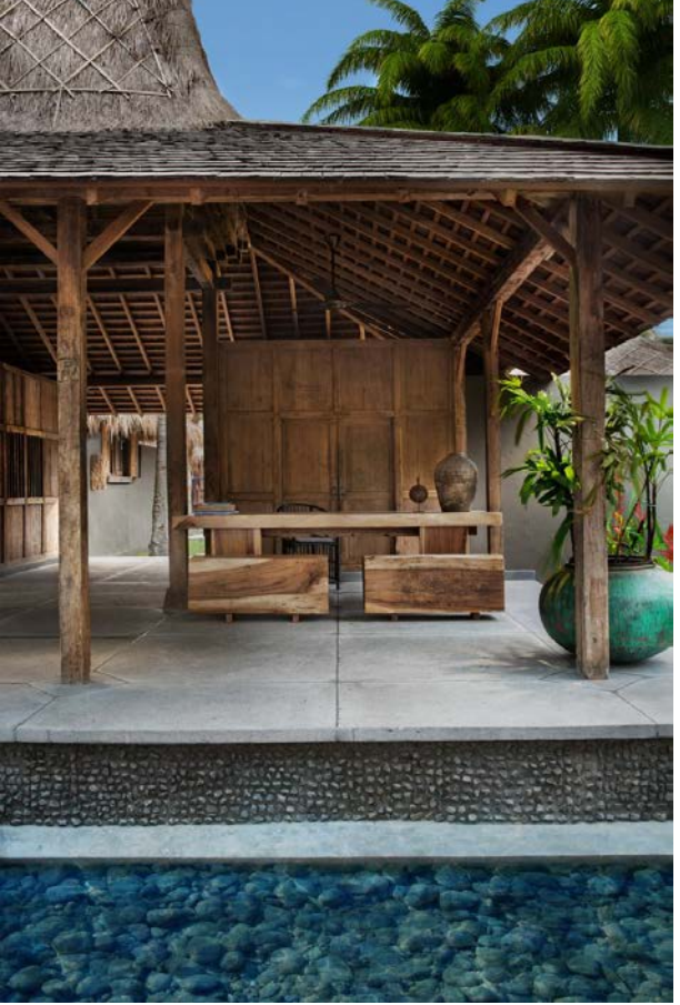
Slow Gili Air Hotel offers ten contemporary luxury villas with private pool and garden. The absolute dream! The villas are fully equipped and you will find your comfort for sure.